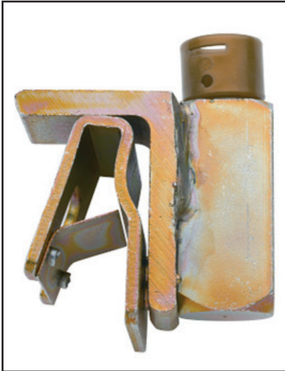
Speedy Side Mount